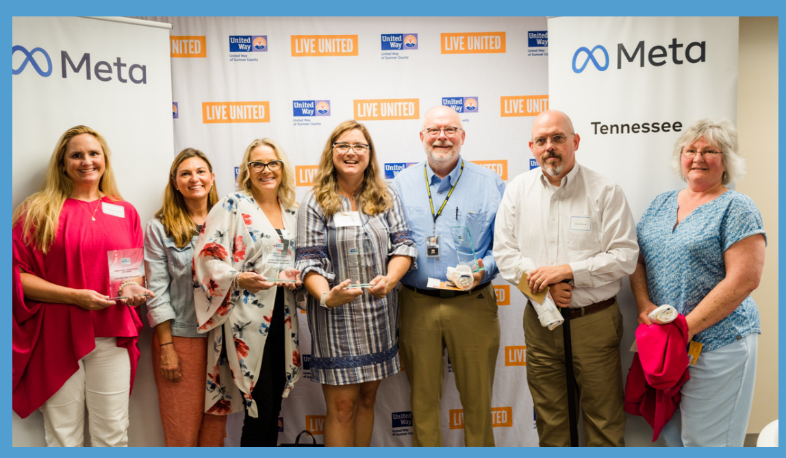
Overall Top Fundraiser, Sumner County Schools