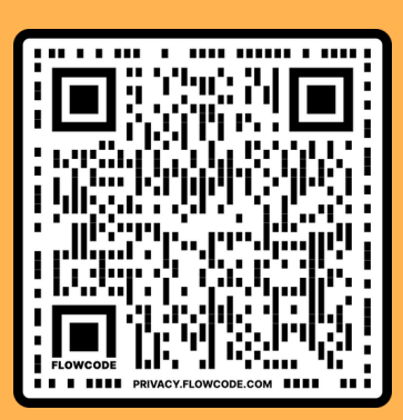
Scan here to donate.

When you invest in United Way of Sumner County, you are investing in multiple programs, initiatives, and services working to improve community conditions. EVERY gift makes a difference!